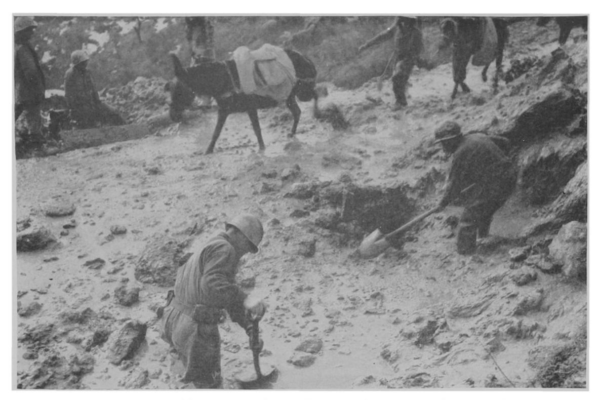
Engineers working on a trail, while an Indian mule train passes by