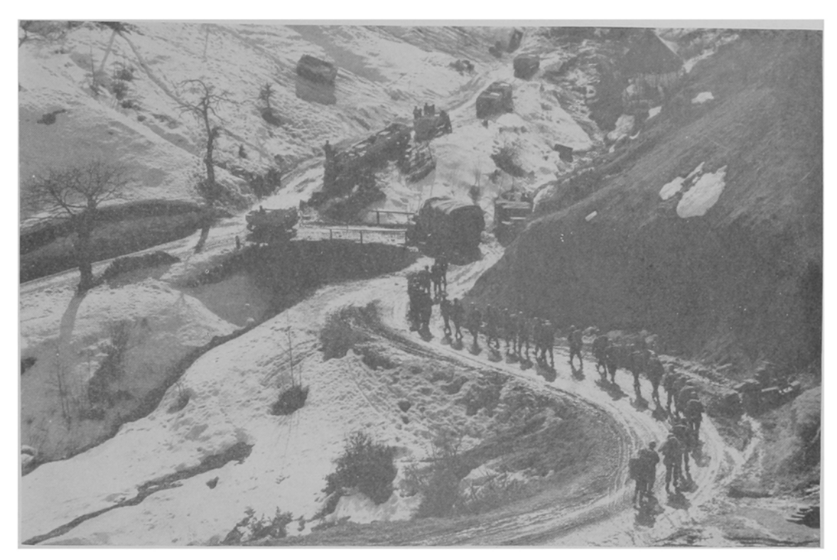
Infantry come out of the front lines on Mount Grande, past trucks and Weasels