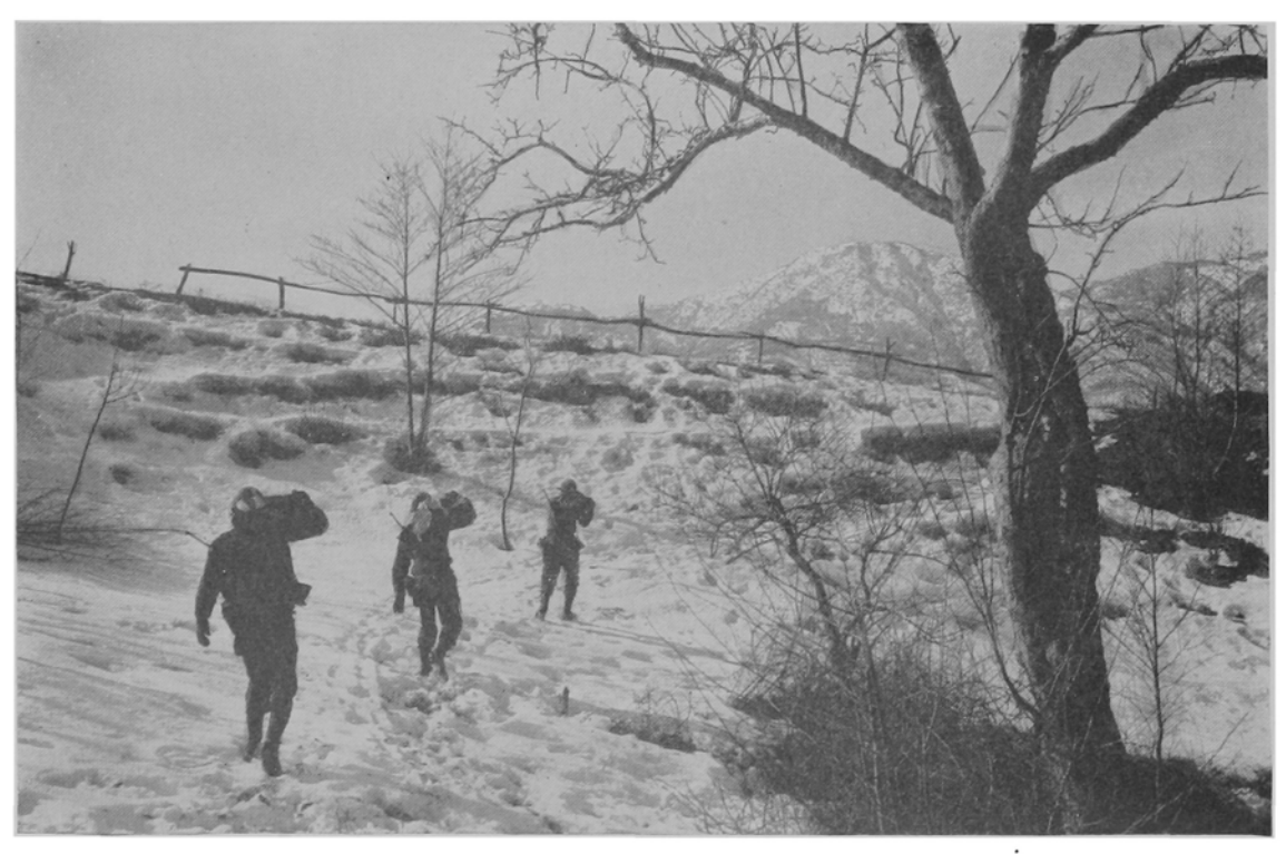
Ammunition for the pack howitzers, at the end of the supply line