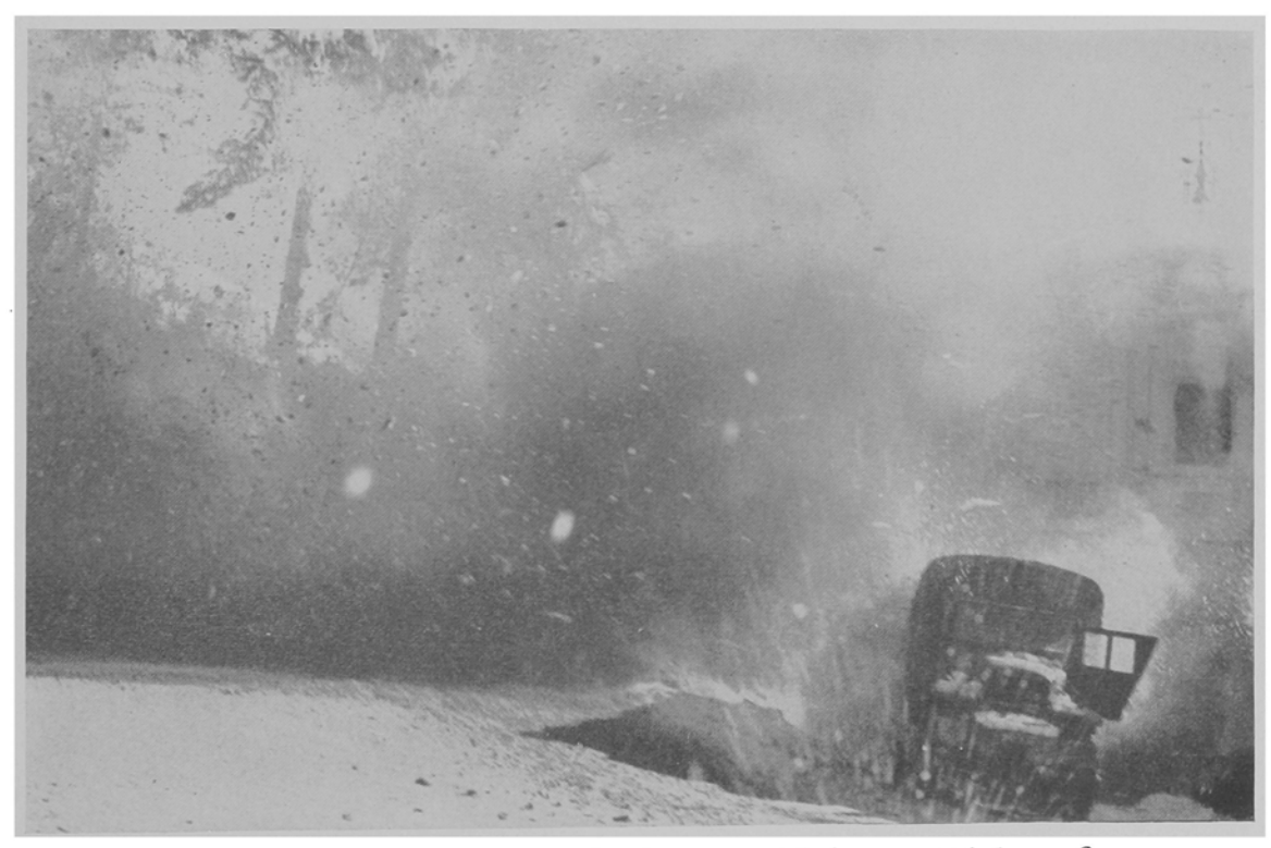
A German shell hits a target in the town of Loiano on Highway 65