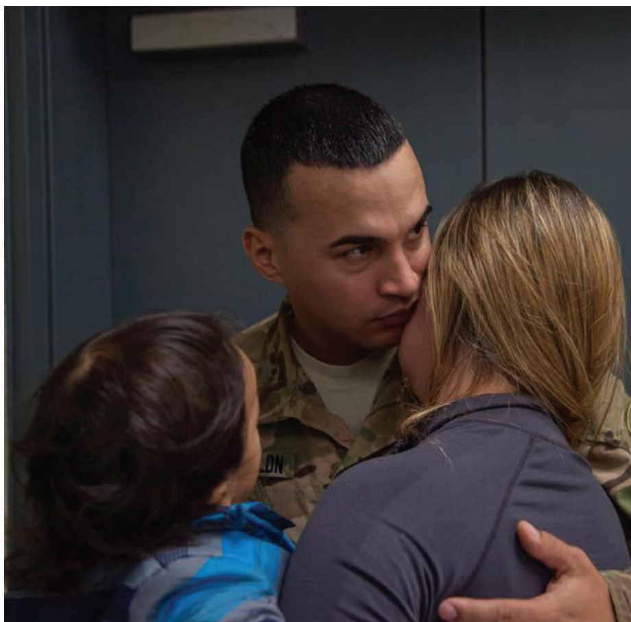
Deployments mean family separations. Headquarters Bn, 10th Mtn Div (LI) is on its way again to Afghanistan (see story, p. 1).