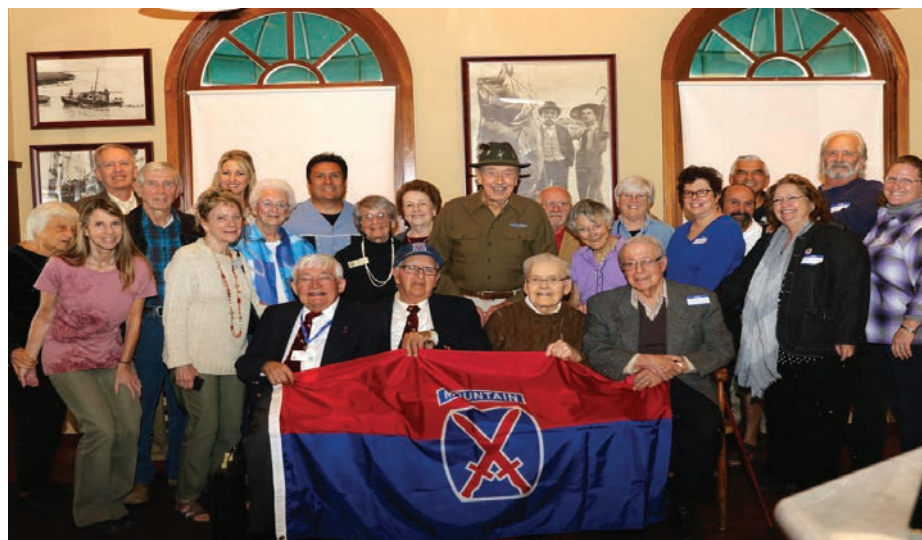
Southern California Chapter members had a great turnout for Mount Belvedere-Riva Ridge Day in February.

The 2015 Christmas lunch will take place at Mahe Restaurant in Seal Beach, CA. on Dec. 5.