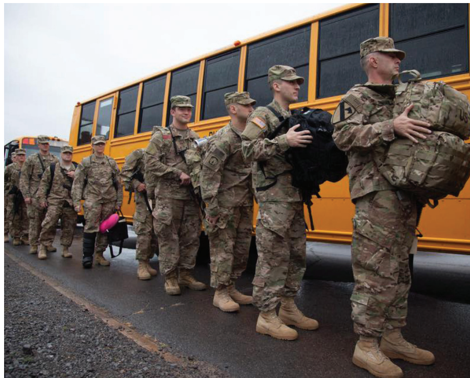
Soldiers of Headquarters & Headquarters Bn board buses for flight to Afghanistan.

PRST FIRST CLASS U.S. POSTAGE PAID PERMIT #184 WATERTOWN, NY 13601