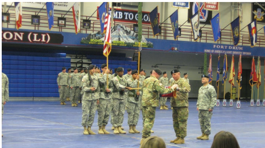
The Tenth Mountain Division flag is furled –not for the first time-- in preparation for deployment of Headquarters to Afghanistan.