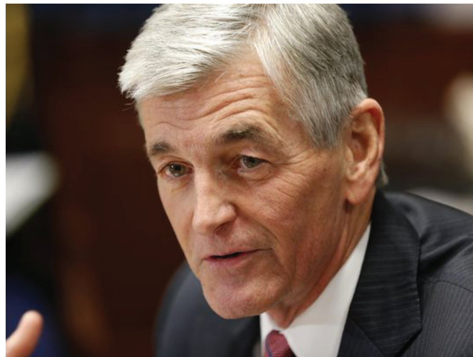
US Army Secretary John McHugh