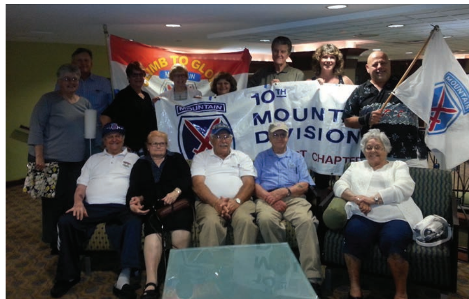
Midwest Chapter gathering, and a good time was had by all, especially enhanced by Descendants in WWII uniforms.

VISIT THE 10TH WEBSITE www.10thmtndivassoc.org