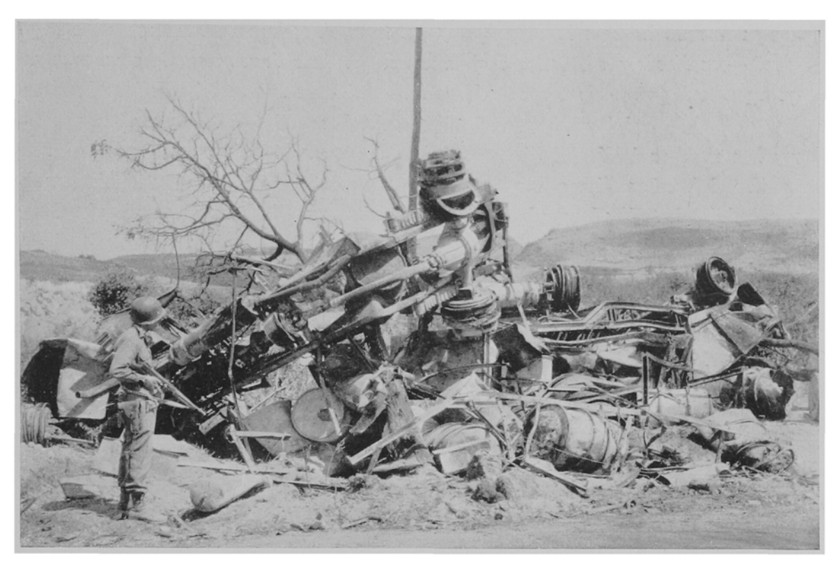
Allied bombing shattered the enemy columns fleeing north of Rome.