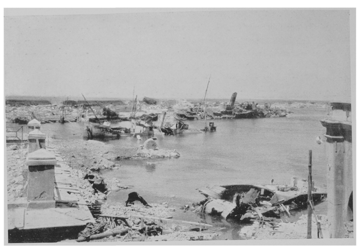
The devastated port of Civitavecchia, as our troops first saw it.