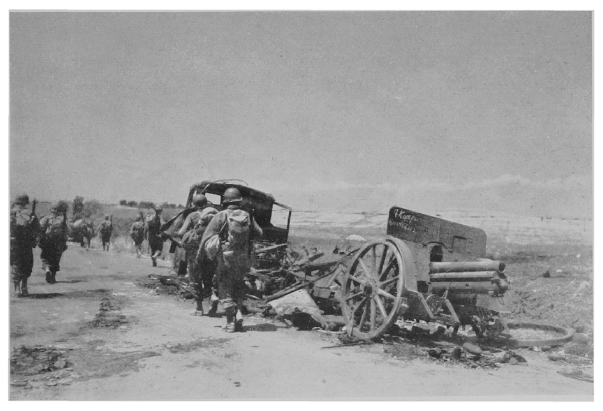
In the Tarquinia area our troops advance past a wrecked German field gun.