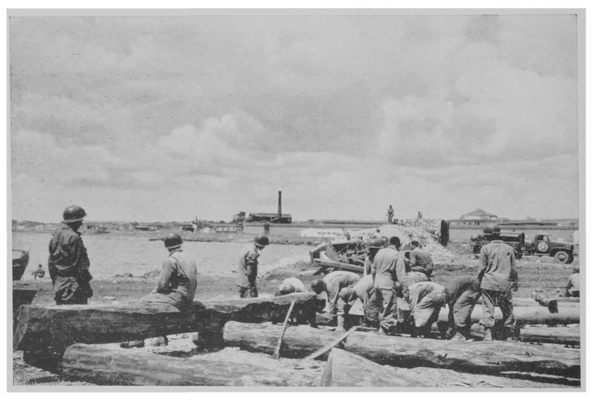
Fifth Army engineers at Civitavecchia prepare a wharf to unload ships.