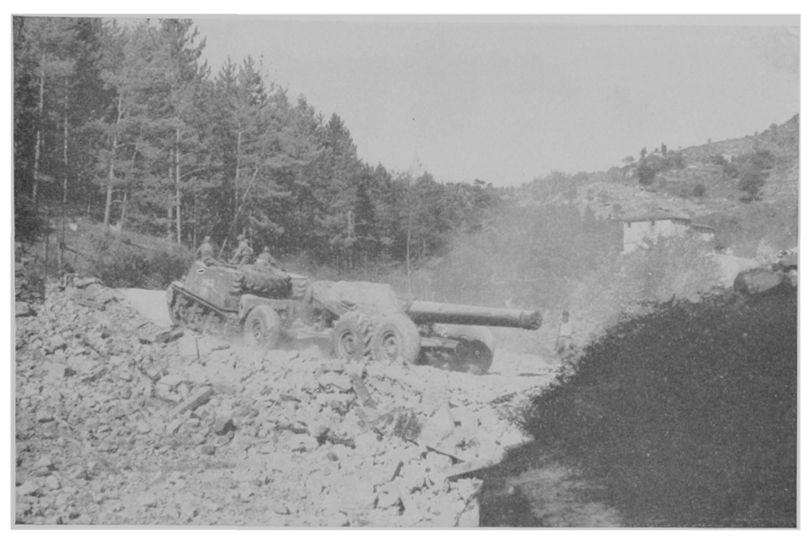
A 240-mm howitzer crosses a road fill while moving up near Vaglia