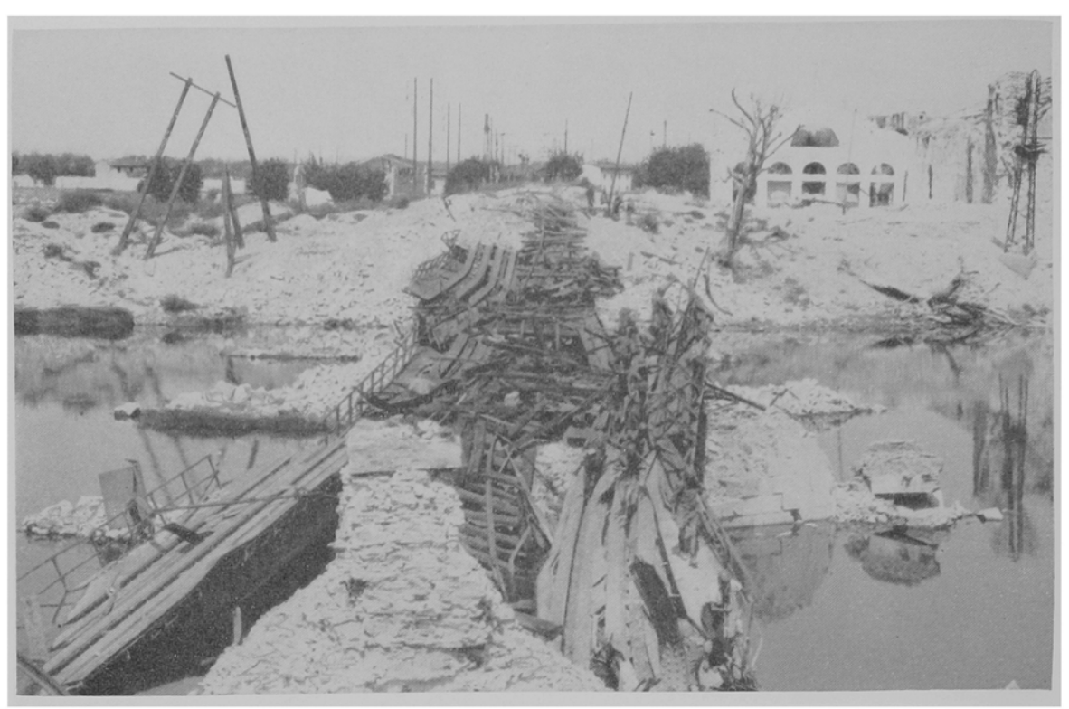
Antiaircraft-infantry troops of Task Force 45 cross on a demolished bridge