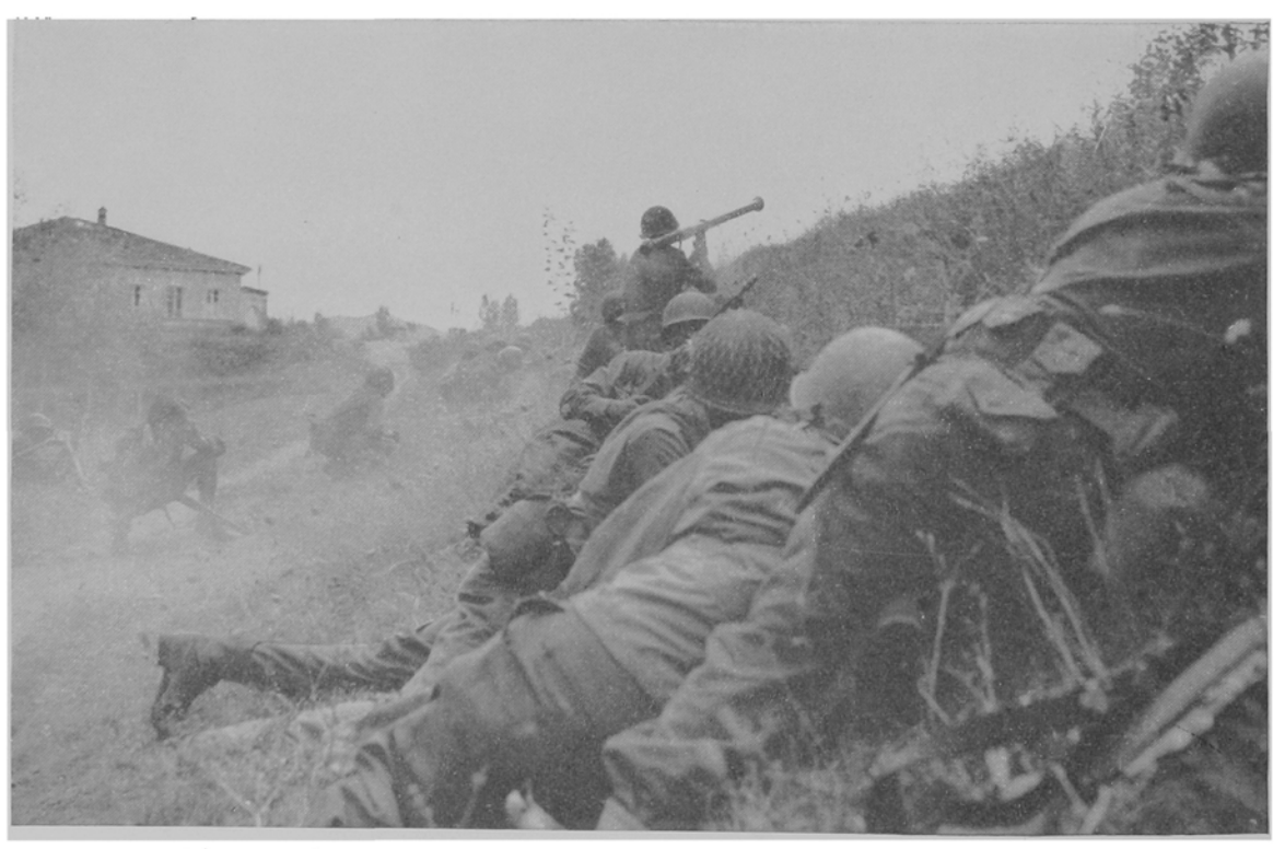
Troops of the 92d Division in action along a canal north of Lucca