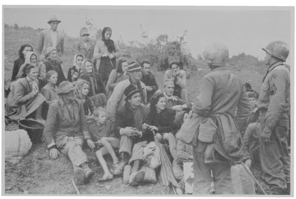
Briefing Italian civilians who are to be evacuated from near the Arno