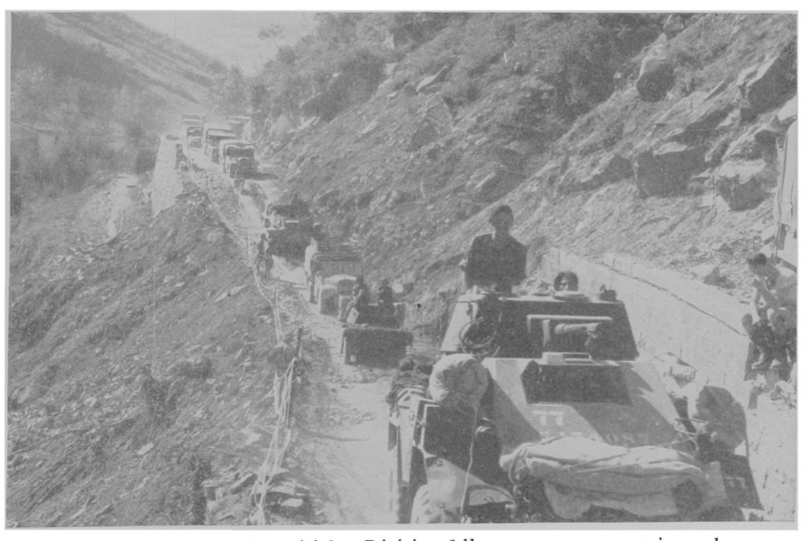
Armored cars of the British 1 Division follow a narrow mountain road