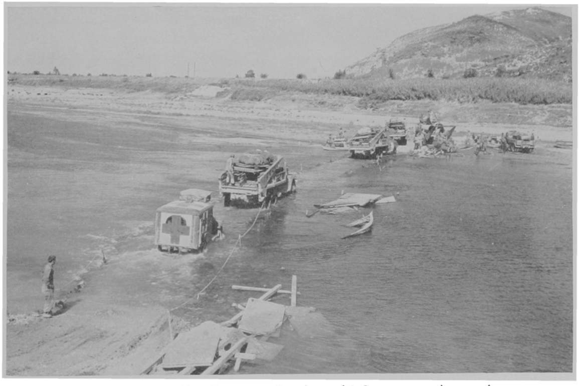
Shallow fords, like this one at Cascina, aided our troops in crossing