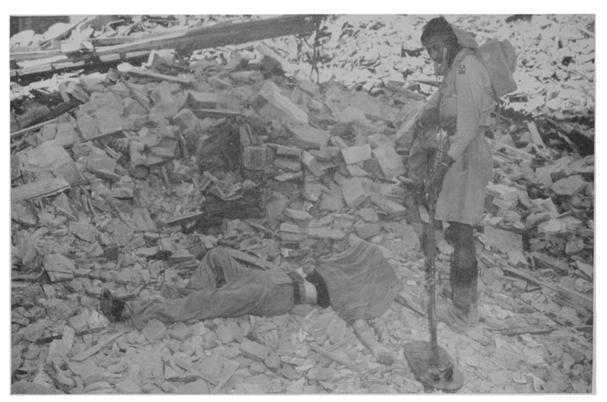
Sapper of the 8 Indian Division searches for mines near a dead Italian