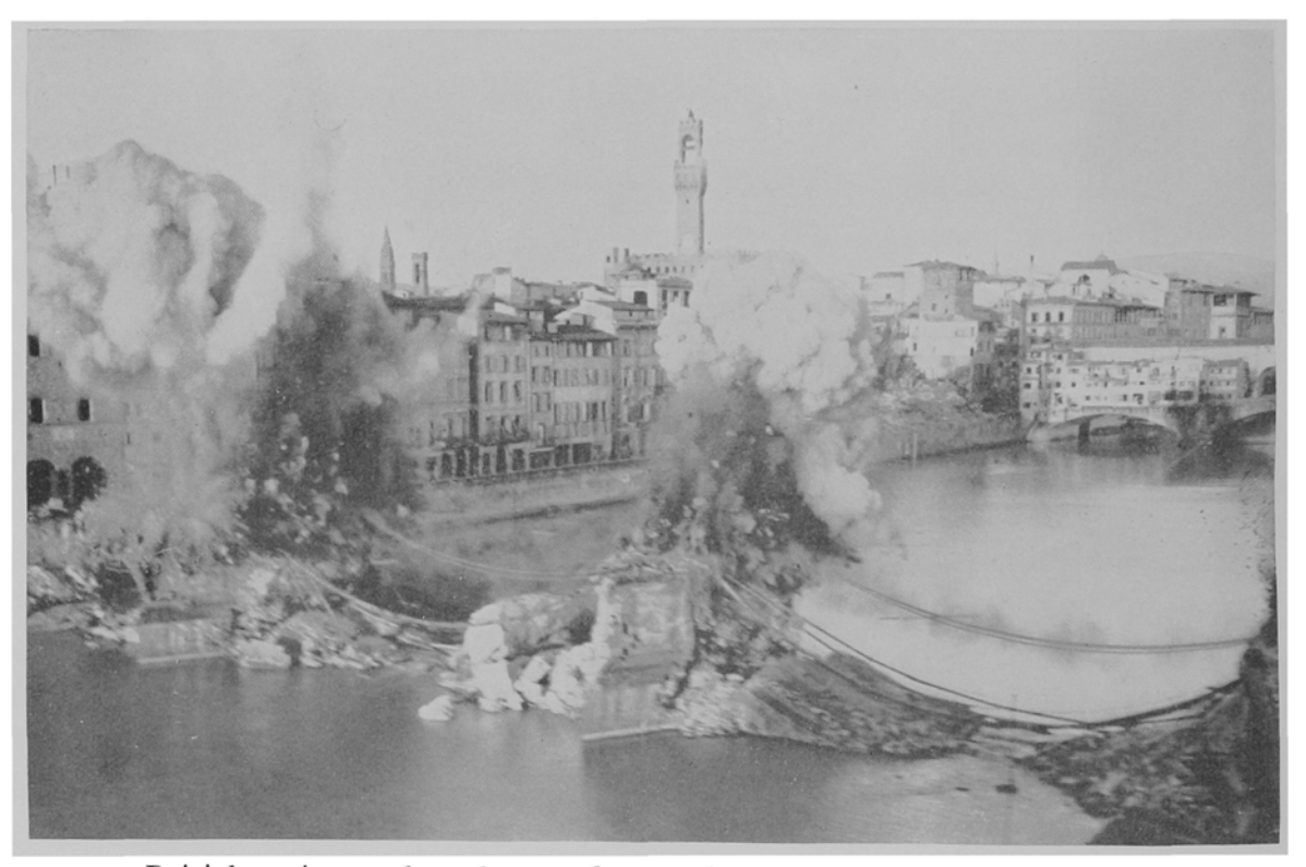
British engineers clear the way for a Bailey bridge across the Arno River