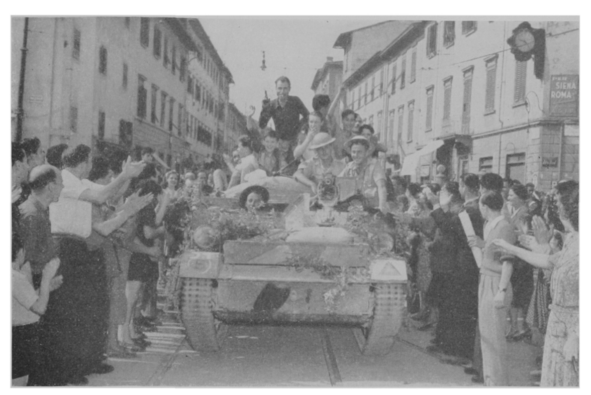
Italian partisans share in the welcome of British troops entering Florence